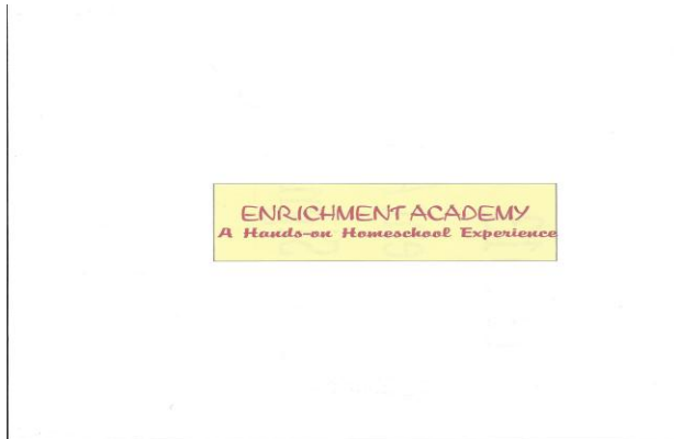
Front Left Pocket